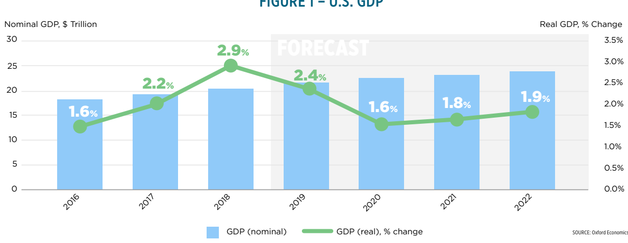
FIGURE 1 - U.S. GDP

A growing yet moderating domestic economy likely means a growing yet moderating domestic travel market. But lower gas prices are expected to continue to give a boost, particularly to domestic leisure travel.