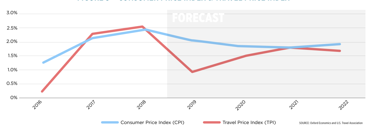
FIGURE 3 - CONSUMER PRICE INDEX & TRAVEL PRICE INDEX

Forecast: After increasing by 2.4% in 2018, growth in the Consumer Price Index (CPI) is estimated to slow down to 2.1% in 2019 and 1.9% in 2020. While growth in the Travel Price Index (TPI) was similar to the CPI in 2018 (at 2.5%) and in the first four months of 2019, it is expected to slow down much more markedly through the second part of the year and settle around 0.9% in 2019 and 1.4% in 2020 (Figure 3).