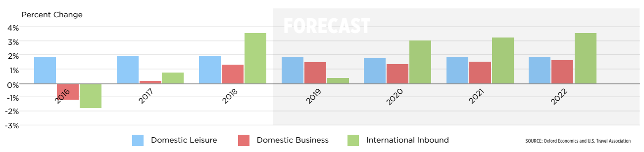
FIGURE 5 - U.S. DOMESTIC AND INTERNATIONAL INBOUND TRAVEL VOLUME