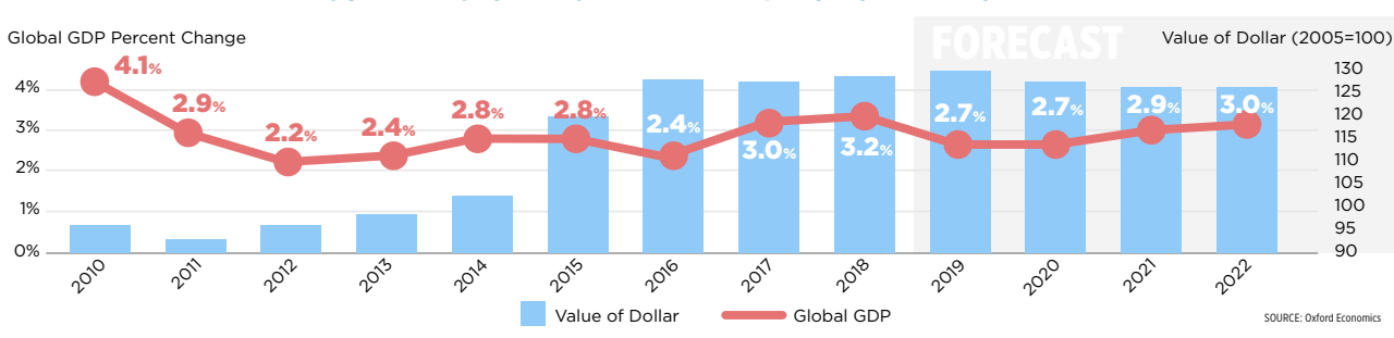
FIGURE 4 – GLOBAL GDP AND THE VALUE OF THE DOLLAR

Forecast: It is always very difficult to forecast currency exchange rates. While the expected lowering of interest rates should in theory lead to a decline in the value of the U.S. dollar, this has not been the case in recent years. The "trade wars," on the other hand, can lead to a relative increase in the value of the dollar (as the currencies of our trading partners would lose value with the decline of the U.S. as a key trading partner), but that too is difficult to predict. Oxford Economics' forecast expects the U.S. dollar to continue strengthening through 2019, with a projected appreciation of 1.2% (weighted average exchange rate index). It then projects a depreciation of 2% in 2020 (Figure 4).